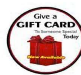
4x4 Round Sticker