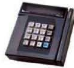
Trans 330 w/printer

NOTE: Please verify with your salesperson if your terminal is compatible with the programs.