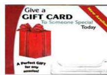
5x7 Acrylic Display