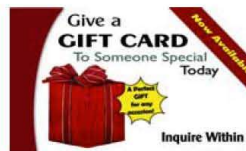
Vinyl Static Cling